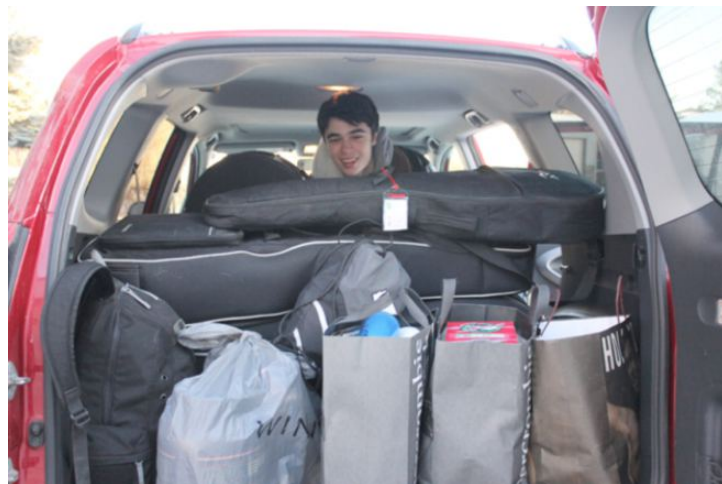
Moving Day !!

See you guys next week, hoping to don't get frozen before!